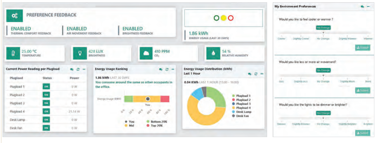
FIGURE 3 The UPSS software dashboard displaying individual energy (plug load) consumption and scheduling, environmental levels and preferences.

design involves the occupancy positioning system (see below) within the zones that detect the actual number of occupants to provide accurate outdoor airflow in compliance with ASHRAE Standard 62.1 and Singapore Standard SS554.